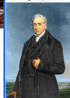
Engineer and inventor